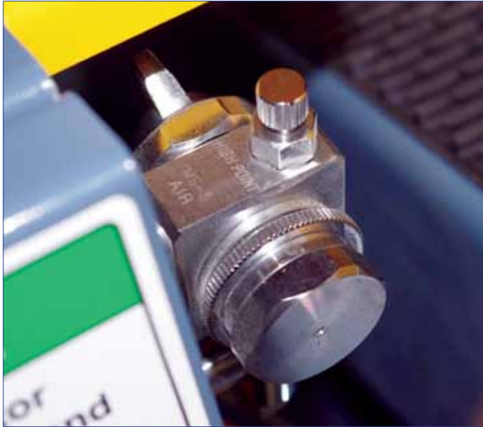
A fully adjustable oil mist system keeps the blade cool and lasting long.