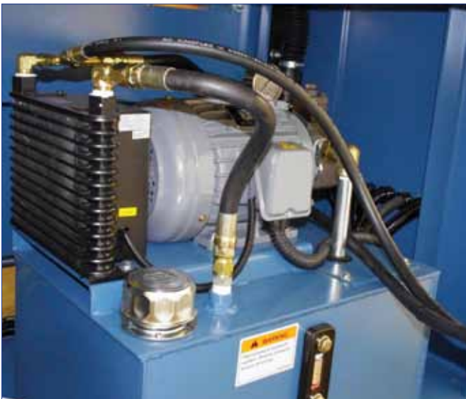
The hydraulic pump and reservoir are conveniently located under the machine frame to reduce the overall footprint of the machine.