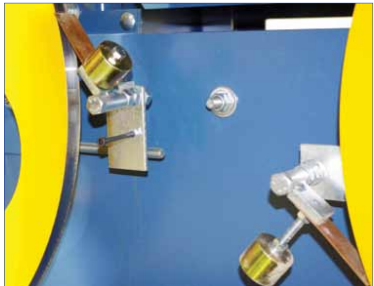
Weighted scrapers keep the saw wheel free of debris and residue build up.