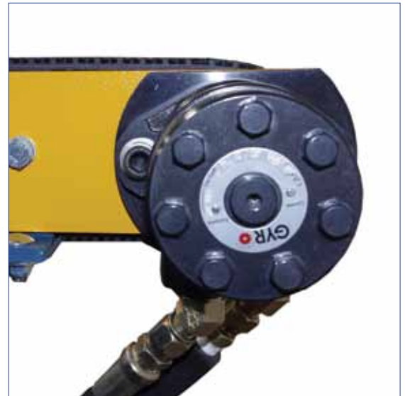
The conveyor feed works is driven by a powerful hydraulic gear motor allowing for more torque thereby ensuring constant feed, unlike a conventional electric motor in this situation.