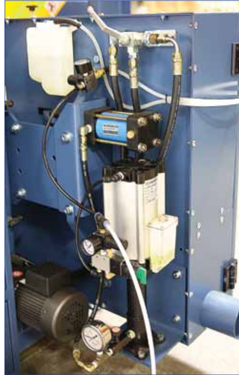
The air over hydraulic system automatically keeps the correct blade tension under different loads.