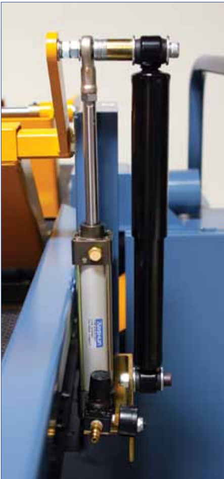
Adjustable air cylinder over shock absorbing system keeps the material securely planted on the conveyor table giving a superior cut.